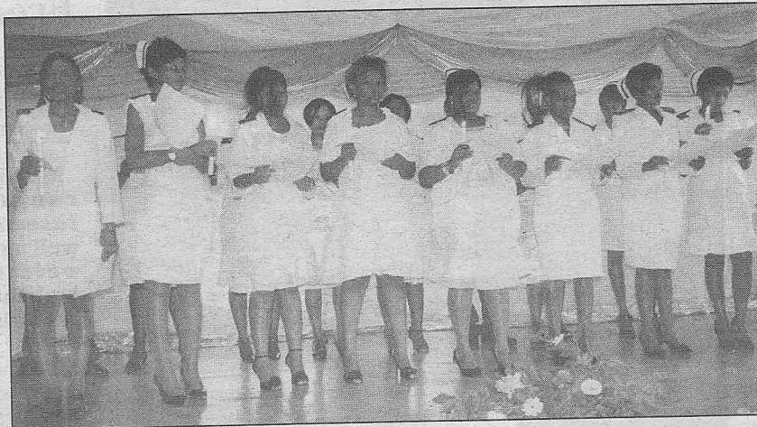
The nurses who were graduation performing a song during the ceremony.